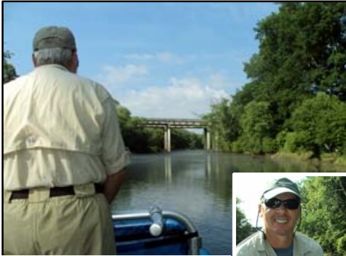
Contact Fannin County community leaders to help recover, improve and conserve the trout fishery of the Toccoa River tailwater.

Residents and business owners can – and must – get the support of our state fisheries officials to recover, improve and sustain the tailwater trout fishery. However, the GDNR has determined that further study is required to implement special fishing regulations that address critical fishery management objectives and angler opportunities for all kinds of fishing and fishermen. We no longer have the luxury of time, because effective September 1, 2011, we can no longer expect the support of the federal trout hatchery that has long provided trout stocking of the riverway. Also, it was learned in early summer 2011 that the Chattahoochee Forest National Trout Hatchery could soon close or scale back its operations, seriously affecting the amount of stocked trout into the Toccoa River. The resources to bring the river back are simply not available, and the TRWC is looking for alternative measures to help the river, including special regulations.